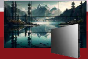
Model No.: SD-LGDWD-DS